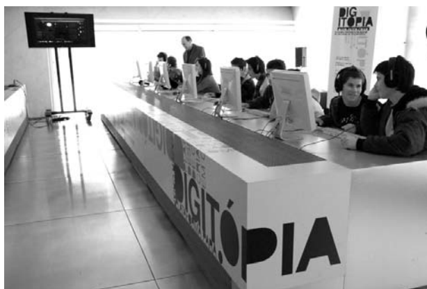
Figure 2. Digitópia - showing one of two tables, with six of twelve stations.

Digitópia is located in the main entrance hall of Casa da Música, a space of great visibility and “unavoidable” by people that pass by regularly, since it is close to the ticket office and main entrance. The connection between the areas is large enough to clearly establish Digitópia as a public area, yet adequately secluded, so visitors can feel at ease experimenting computer music making sometimes for the first time. The space is large enough to comfortably accommodate twelve similar stations – with two seats each, divided in two long tables facing each other – and has natural light.