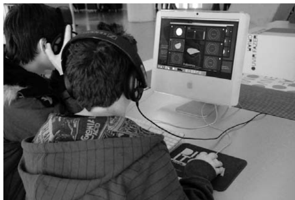
Figure 2. Two young users composing with Políssonos on a guest account.

The following programming environments are also available: miniAudicle 9 , Processing 10 , Pure Data 11 , SonicBirth 12 , SuperCollider 13 and the commercial Cycling’74 Max/MSP 5.