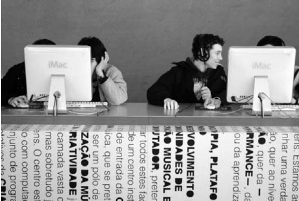
Figure 4. Teenagers are the main group of Digitópia users.

After the first months of activity, Digitópia has already begun to enter the routines of some users, most of them youngsters. Some of them have reported great musical experiences and a few went on to develop new musical listening and experimentation habits after visiting Digitópia.